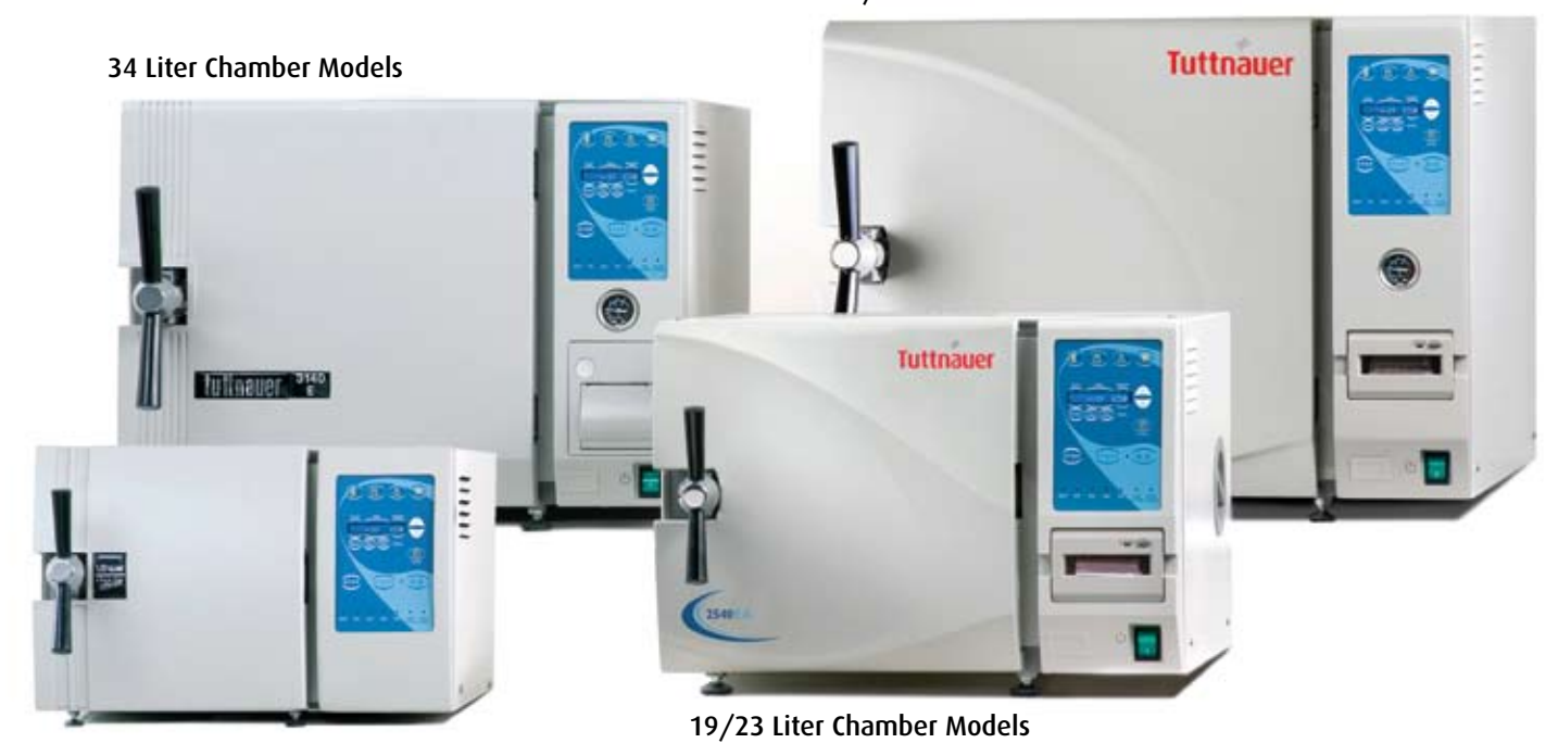
7.5 Liter Chamber Models