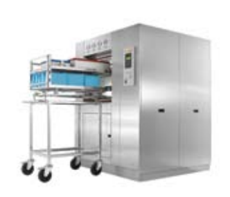
Large sterilizers for various industries and market needs

Featuring Tuttnauer's range of cleaning, disinfection and sterilization solutions