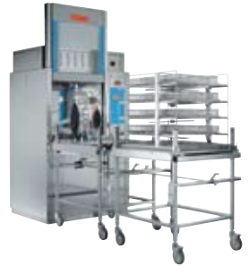
Washers/disinfectors for hospitals and laboratories